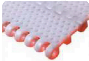
Flush grid 23 % open