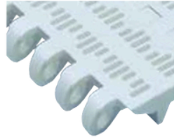
Flush grid 18 % open